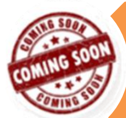
TBD Asset Management Assoc.