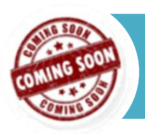
TBD Asset Management Senior