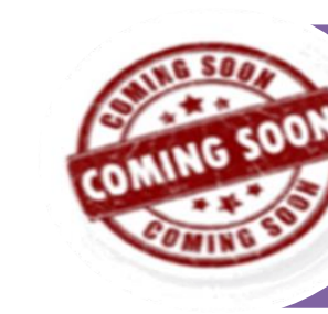
Vacant Real Estate Assoc.