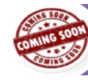
Vacant Risk & Controls Manager