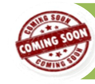
Vacant Risk & Controls Prof.