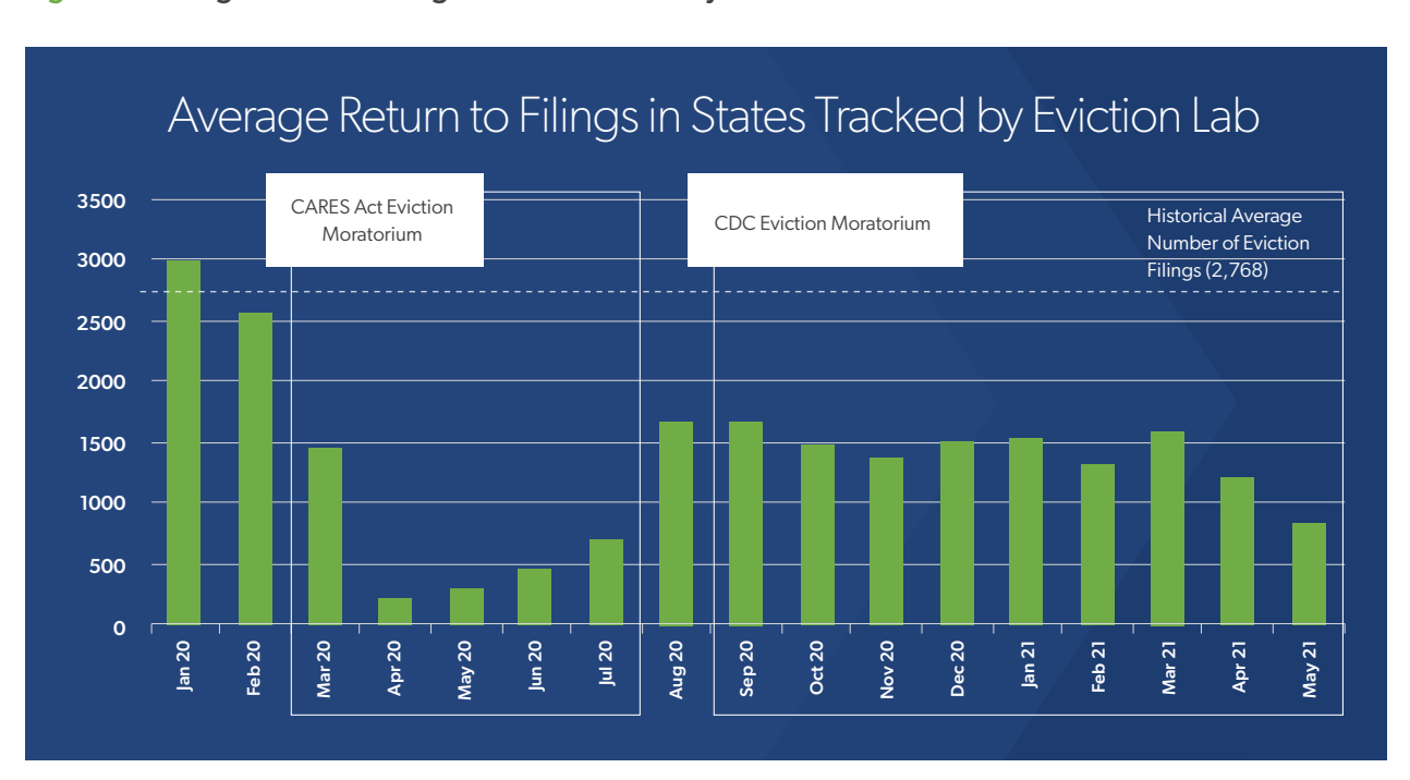
Figure 1: Average Return to Filings in States Tracked by the Eviction Lab at Princeton

Across the states and cities tracked by the Eviction Lab, this distinction between the prevention of eviction and the prevention of filing for eviction appears in the data. Under the CARES Act, eviction filings were down considerably. Once the CARES Act moratorium ended, state or local moratoriums governed until the CDC moratorium was put in place, so during that period only the local moratoriums that prohibited eviction filings would have affected behavior. Consequently, in the aggregate across the states tracked by the Eviction Lab—and consistent with what was allowed under the CDC moratorium—eviction filings increased, though not necessarily to pre-pandemic levels.