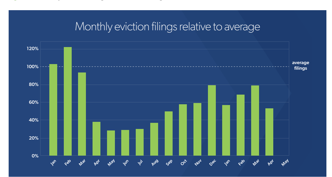
Figure 3: Monthly Eviction Filings Relative to Average in Phoenix, AZ<sup>9</sup>

While formal moratoriums can prevent eviction, it does not necessarily follow that they prevent pressured departures. This is perhaps especially true during a period where evictions are prohibited but filings are not. A renter can easily take an eviction notice as an indication to leave. Likewise, a notice of non-renewal of lease can have the same effect, even if in neither case the renter can be formally evicted during the moratorium. These sorts of departures are much more difficult to track directly in the data.